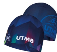
MICROFIBER REVERSIBLE HAT