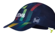
PACK RUN CAP