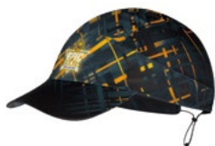
PACK RUN CAP