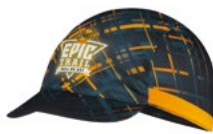
PACK BIKE CAP